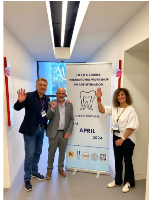
Fig. 1: Some of the resource faculty (above) and enrolled participants at the Age Estimation Workshop.

All participants received 28 hours of age estimation participation continuing education credit. These certificates were provided by IOFOS and by the School of Medicine, University of Lisbon. At the end of the workshop, participants were given two age estimation cases and were asked to undertake age estimation and then submit a written report for each case. This was a proficiency test and reports were evaluated by the scientific committee. Those participants who met the age assessment and report writing criteria received a certificate of proficiency for 2 years and it was immensely gratifying to see all participants being successful. Details are available at https://iofos.eu/2024-proficiency-test-on-age-estimation/ .