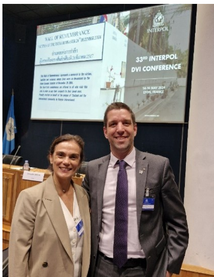
Fig. 1: The President and Vice-President of IOFOS at the 33 rd INTERPOL DVI Conference.

On the second day, additional lectures were presented and some topics debated on ISO and Forensic Odontology with implications in human identification.