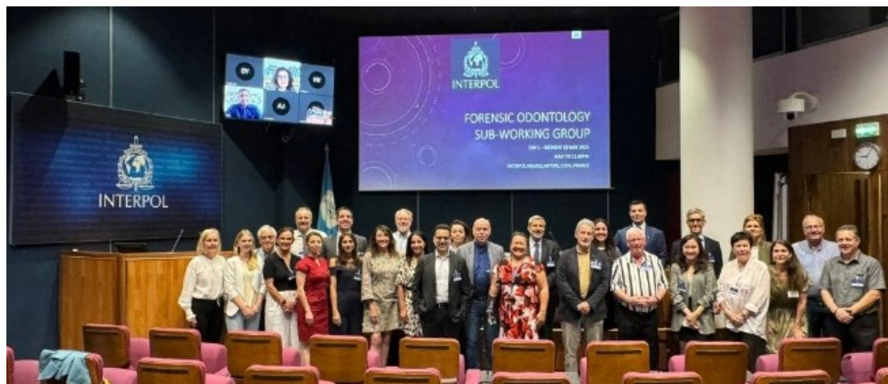
Fig. 2: The Forensic Odontology Subworking Group met at the Conference.