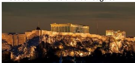
The IALM 2024 congress was organised in historic Athens, Greece.

The meeting attracted participants globally, so it was a wonderful opportunity to partake in a scientific event of this magnitude where odontologists were able to actively cooperate and connect with a broad spectrum of forensic experts from across the world. Also, beyond the scientific aspects, the conference was a wonderful opportunity to once again meet dear friends and colleagues.