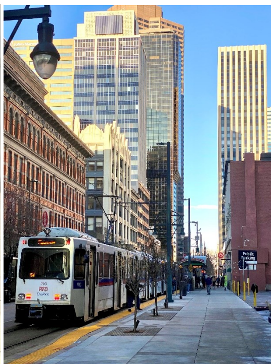
Fig. 2: Denver, in western United States, served as the backdrop to the AAFS 2024 meeting.