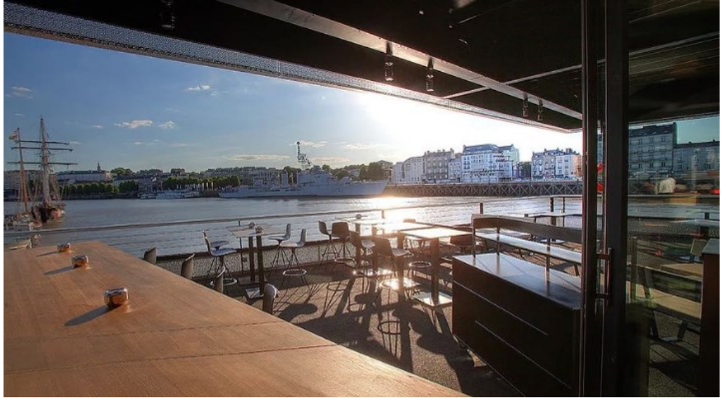
Fig. 2: Gala dinner is planned on the O'Deck Barge on the Loire River.

Newsletter of the INTERNATIONAL ORGANIZATION for FORENSIC ODONTO-STOMATOLOGY (IOFOS) Volume 46, Issue 1, June 2024 | www.iofos.eu