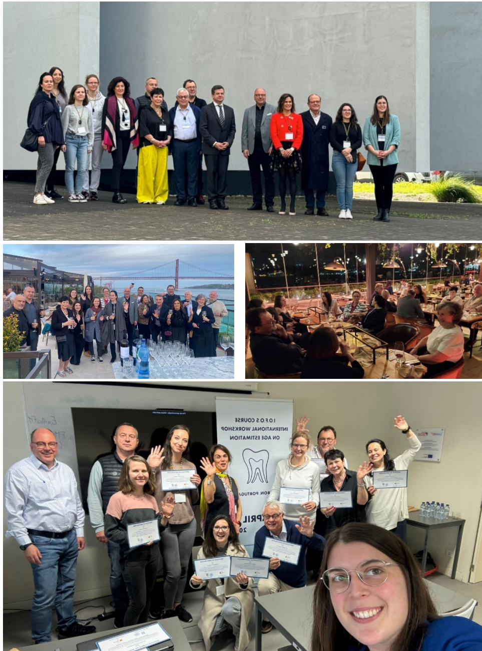
Fig. 2: More visuals from the educational and social events of the IOFOS International Workshop on Age Estimation.

typical old neighbourhood of Lisbon. The event photos can be accessed at https://iofos.eu/gallery/ . The next IOFOS International Workshop on age estimation will be from 9–12 September 2025 in Florence, Italy, and we invite you to attend the course. The limit is 20 participants.