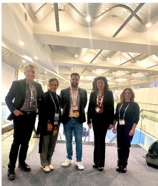
Fig. 1: The IOFOS President, IOFOS Treasurer and Editor of JFOS with other participants at the conference.

Apart from the professional and scientific components, the social part was also very interesting. In Denver (Fig. 2) – a city located 1,500m above sea level and with clean and rarefied air due to the nearby Rocky Mountains whose peaks reach up to 4,000m and are permanently covered in snow, it provided all participants with numerous beautiful locations and moments. A city where you can feel democracy and the smell of legalised marijuana is