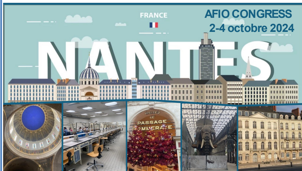
Fig. 1: AFIO Congress Flyer